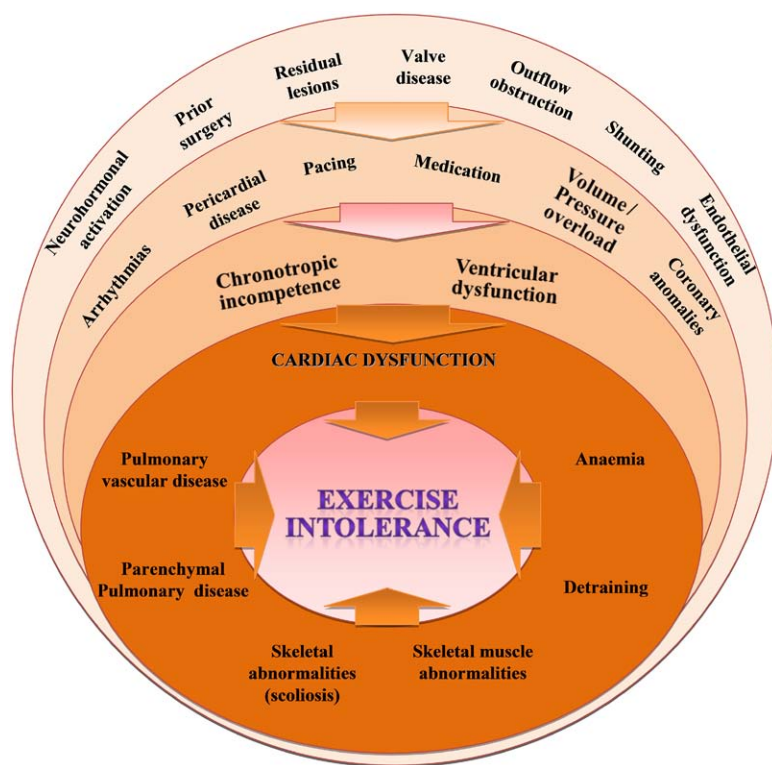
Figure 3. Mechanisms of exercise intolerance in patients with adult congenital heart disease (CHD). Exercise intolerance in adult CHD is the result of cardiac dysfunction, but also important are noncardiac factors relating to the congenital defect, previous surgery, and systemic effects of heart failure. 1–3,13,18